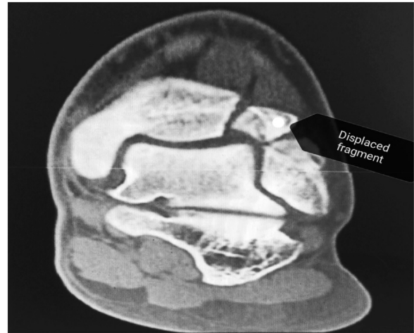
Fig. 4. Pre-operative coronal CT scan of ankle joint showing displaced Tillaux fragment.