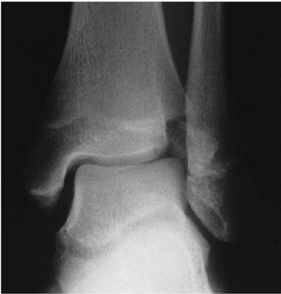
Fig. 2. Pre-operative AP X-ray ankle joint view showing displaced Tillaux fracture.