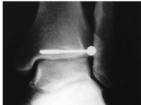
Fig. 5. One year post-operative AP X-ray view showing proper union without arthrosis.