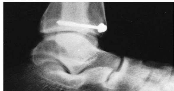
Fig. 6. One year post-operative lateral X-ray view showing proper union without arthrosis.

it is of paramount importance to mention more about the nature of the distal tibial epiphysis and its closure sequence to make the reader able to understand the mechanism through which Tillaux fracture can occur. Due to rarity of Tillaux fracture, a review of the literature revealed only a few studies dealing with this type of fracture and most of them were case reports or small number case series [12–14]. We reported on one of the largest case series of