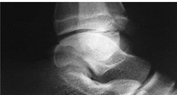
Fig. 3. Pre-operative lateral X-ray ankle joint view showing displaced Tillaux fracture.

The term Tillaux fracture was firstly described by Paul Jules Tillaux in 1892 who described a fracture of the anterolateral distal tibial epiphysis that is commonly seen in adolescents [10,11]. A similar injury to the posterolateral tibia was later described by Chaput and has been called the fracture of Tillaux-Chaput [10]. In spite of the relatively long introduction at this work, we found that